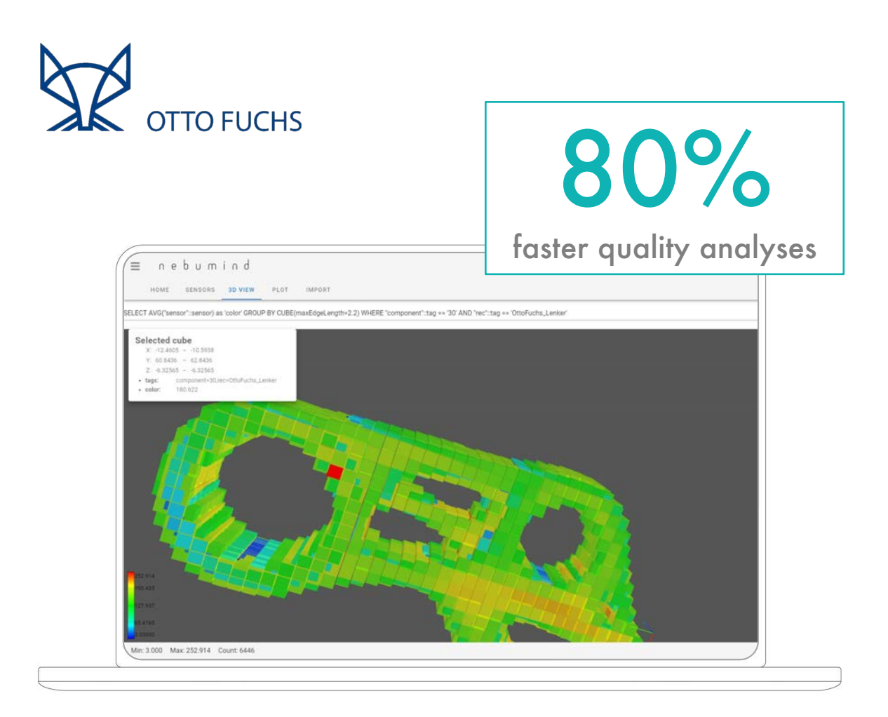
From visual to automated quality control